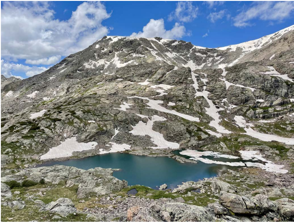
Krista Hughes, 1st Place in 2022 Photo Contest

Just in time for the holidays, purchase ESWA's lovely notecards featuring the three winning photos from this year's contest. Notecards make great gifts, while also supporting ESWA's mission. A box of 12 cards with envelopes is just $25 (postage included). Email store@eaglesummitwilderness.org .