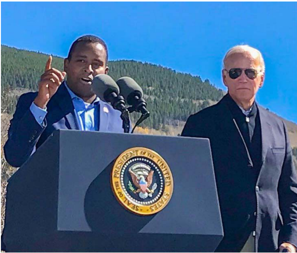
Congressman Neguse with President Biden