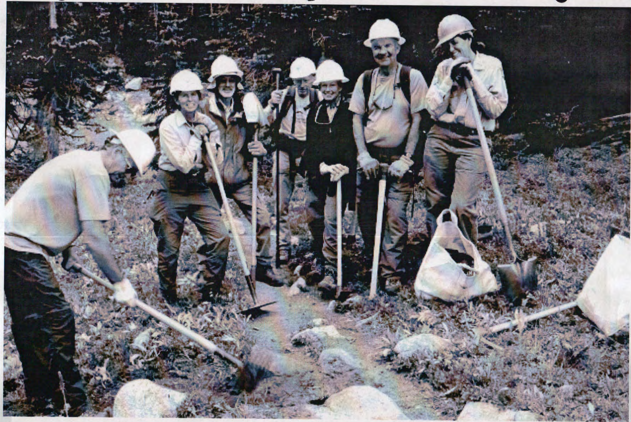
BUMBAKOR WILLOW LAKES BOONVILLE ALASKA TRAIL CREW